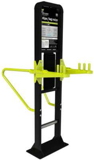
Item 1: Dips & Leg Raise