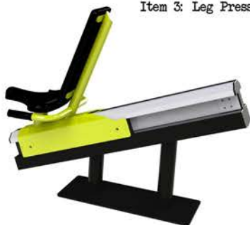
Item 3: Leg Press