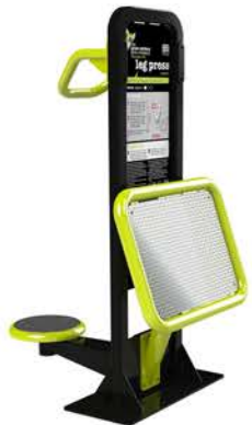
Item 2: Oblique