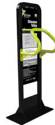
Item 6: Fitness Bike