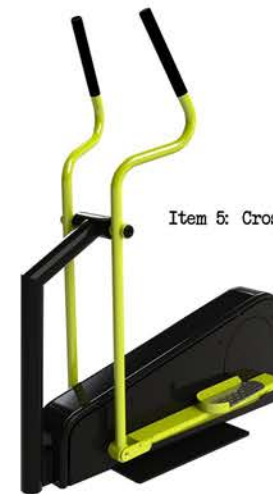
Item 5: Crosstrainer