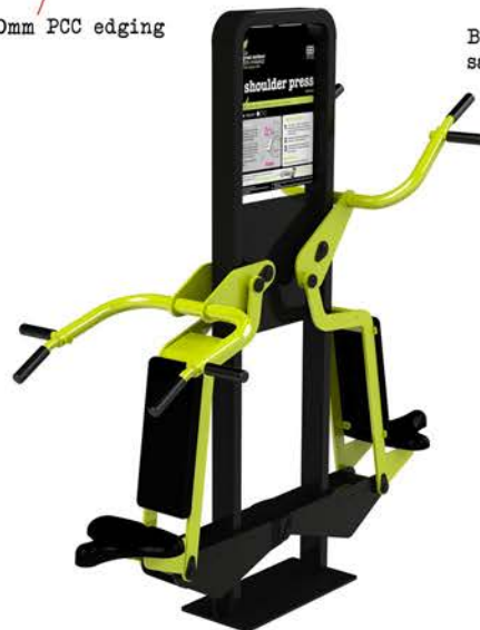
Item 4: Shoulder Press & Lateral Pull Down