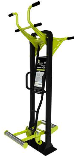
Item 7: Pull Up & Assisted Pull Up